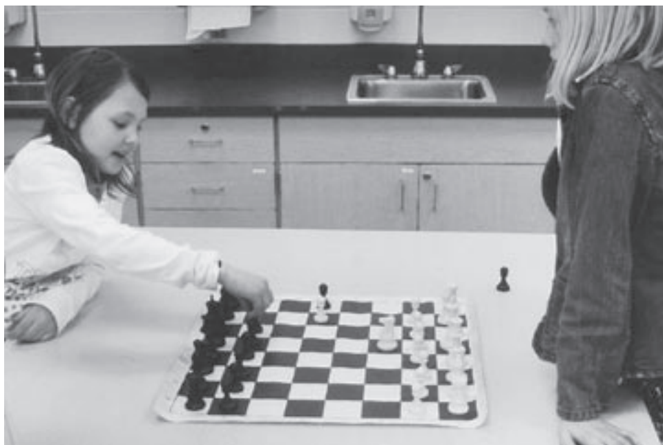
4th and 5th grade Chess Club at Evergreen and Springview Elementary Schools

During the month of November, the Foundation offers local teachers, from elementary through high school in both the Public and Christian School, the opportunity to apply for a maximum grant of $200 from the Greatest Needs Fund, to support innovative classroom programs. In 2008, the Foundation received 28 teacher mini-grant applications for projects ranging from a Classroom Floor Globe to help teach middle school students modern geography to Chess Tournaments that encourages critical thinking in the elementary school. The Foundation is pleased to offer these popular Teacher mini-grant opportunities that enhance education in the Allendale area.